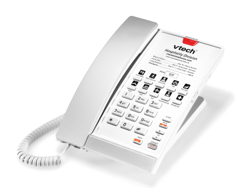
A2210 (Silver/Pearl, 10 Speed Dials)

1-Line Analogue Contemporary Corded Hotel Telephone