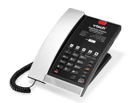
A2210 (Silver/Black, 5 Speed Dials)